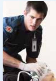
Science, Health and Education