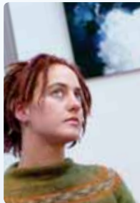
Arts and Social Sciences